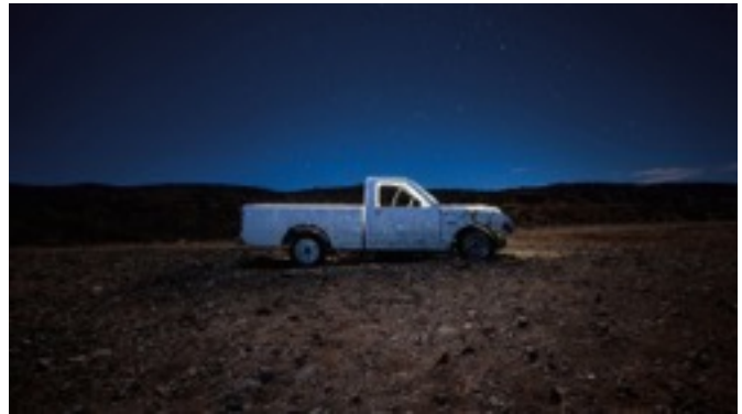
Pick-up #1 , Jean-François Bouchard, 2019, Edition of 3, Chromogenic print, 42" x 84".