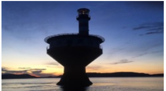
Le Rêve , Mat Chivers, 2018, Looped single channel video installation, 11 min.