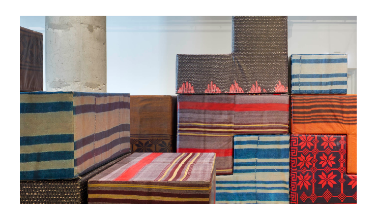
Demos: A Reconstruction, Andreas Angelidakis, 2019, Foam and vinyl seating modules, variable dimensions.