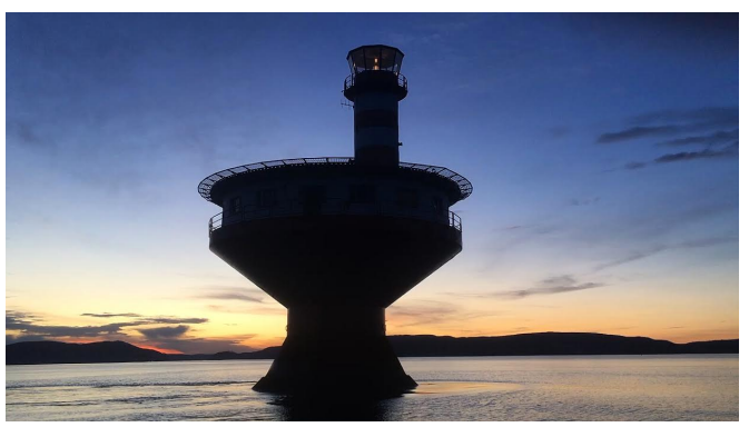
Le Rêve, Mat Chivers, 2018, Looped single channel video installation, 11 min.