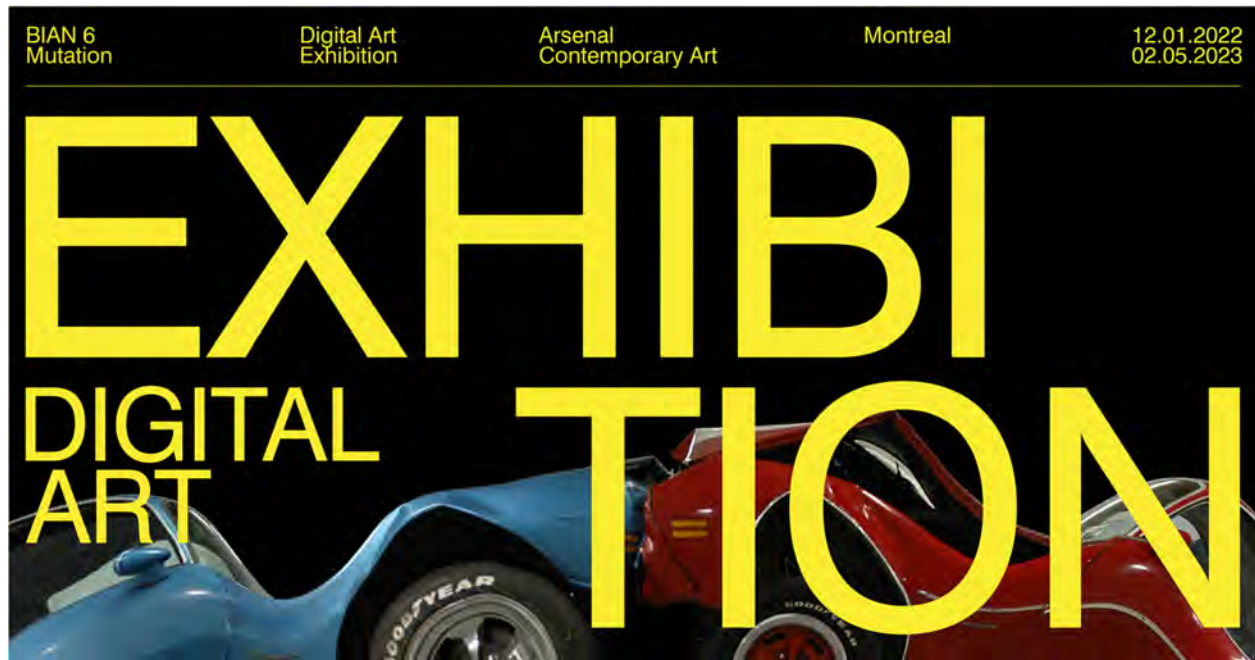
Slow-Motion Car Crash (Slow Inevitable Death of American Muscle), Jonathan Schipper, 2009

DECEMBER 1, 2022 – FEBRUARY 5, 2023 Arsenal Contemporary Art Montreal welcomes The 6th International Digital Art Biennial (BIAN) METAMORPHOSIS - MUTATION